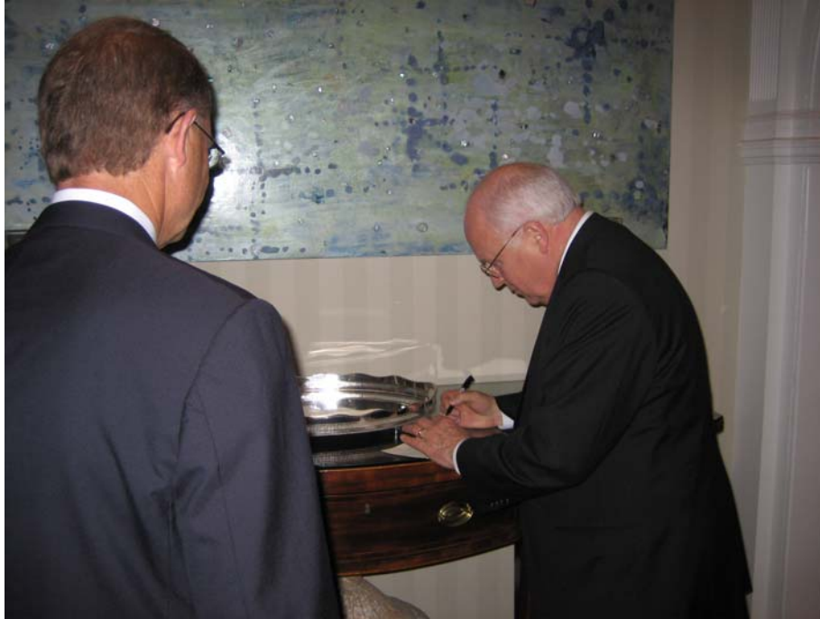
Vice President Cheney, adding a few new jokes to his set before the show.