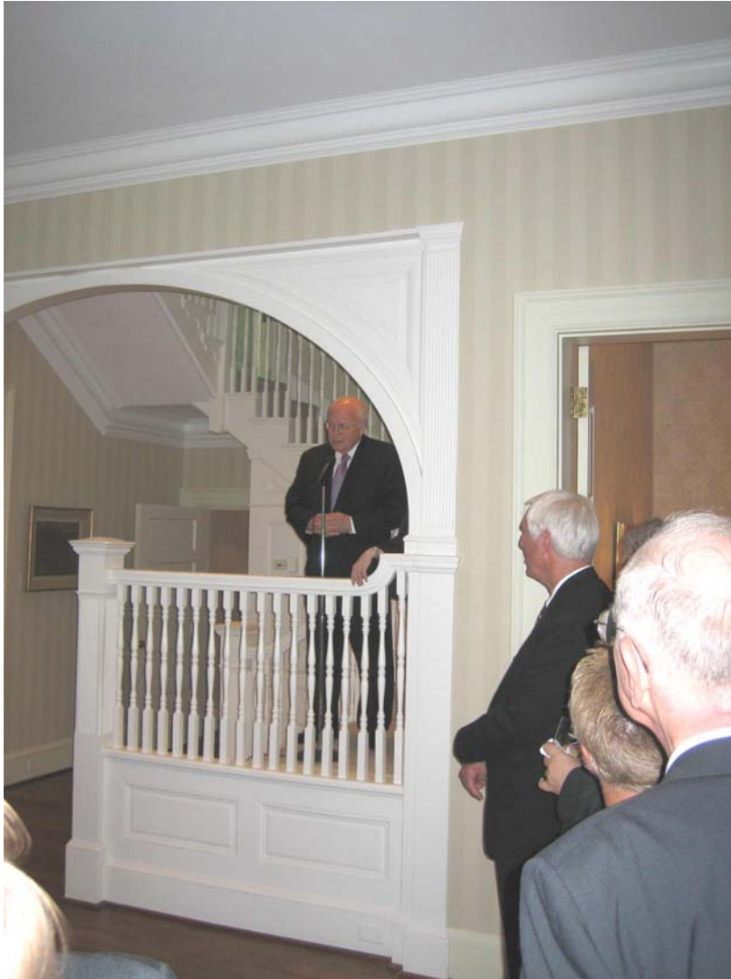
Vice President Cheney, explaining why he lives at the Naval Observatory: "It's where Vice Presidents go to observe their navels."