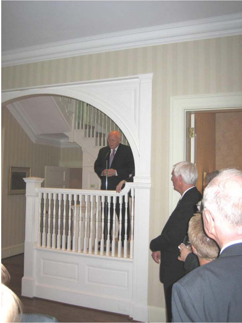
Vice President Cheney, explaining why he lives at the Naval Observatory: "It's where Vice Presidents go to observe their navels."